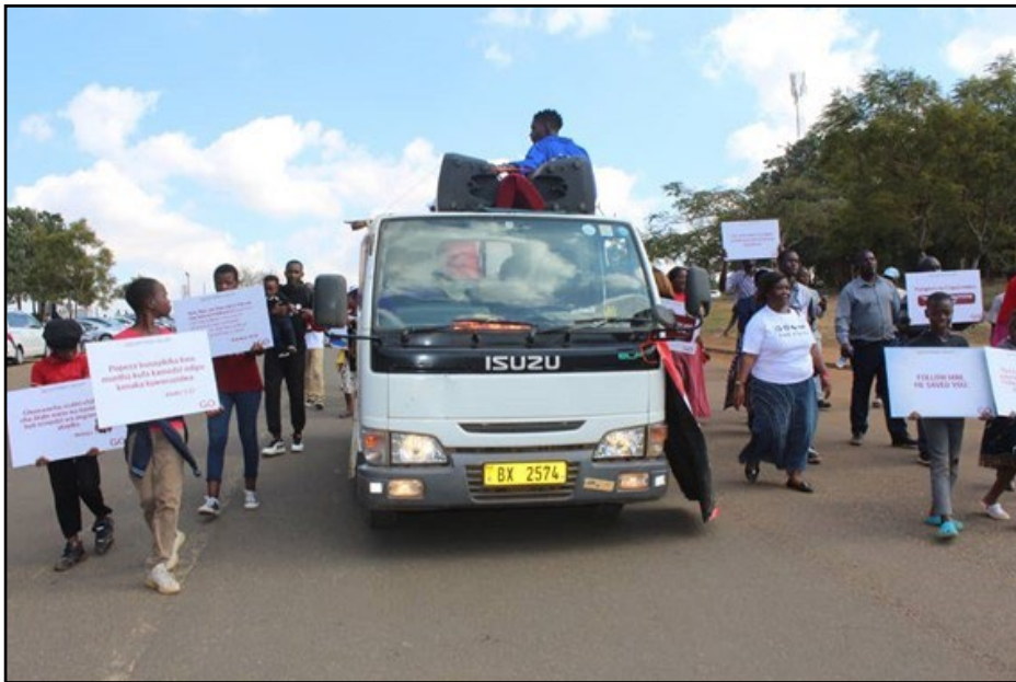
Lilongwe City Youth Evangelism campaign

As Youth for Christ, we continue with the vision to reach every young person in Africa and to join hands with those in the same mission to help us get closer to our vision. Christian leaders, organizations, movements and ministries in Africa have reaffirmed the commitment to getting the Gospel to all of Africa, declaring a decade of evangelism up to 2033.