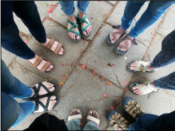
"Here I am. Send me!" Isaiah 6:8

This inspirational verse records Isaiah's response to the calling that God placed on his life. In the same response, Youth for Christ personnel are living out the call to reach EVERY youth in Africa with the Gospel, seeing them encounter Jesus and their lives transformed.